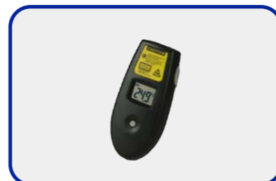
Infrared Temperature Gauge x1