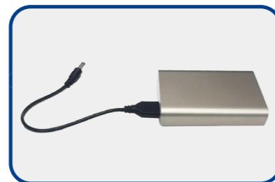
Mobile Power Pack x 1