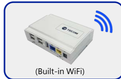
IoT Gateway x1 (Built-in WiFi)